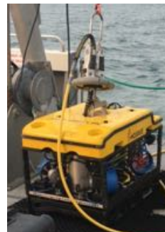
Rov with bullet