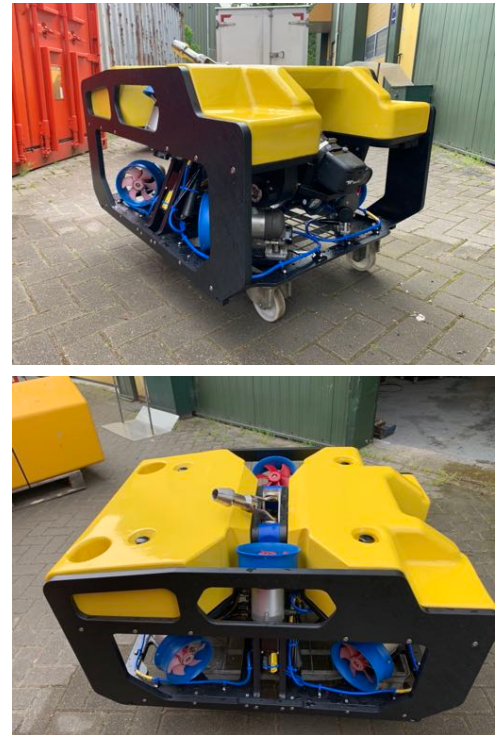
Figure 2: Rov

The Rov is an advanced observation-class ROV that can handle various underwater missions such as inspection, survey, and tooling. It is based on the Mojave model from Sub-Atlantic, but we have modified, redesigned, and improved it in many ways. For instance, it has two vertical thrusters instead of one, and the frame has been widened and lengthened to enhance the stability and increase the payload from 9 to 42 kg. The extra vertical thrust enables the Rov to operate in stronger currents. The frame modification allows for easier attachment of external additional equipment.