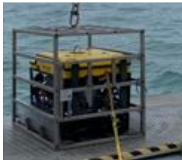
Rov with cage

Launching of the vehicle can be done by cage or with the lock-latch and bullet. Both are made heavy to guide the umbilical constant in a safe matter while the vessel is on DP. To safely use the full length of the tide, the vessel need to be positioned in such a way that the Rov is always in a blowoff position.